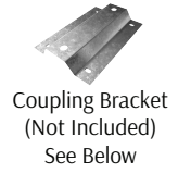
Coupling Bracket (Not Included) See Below