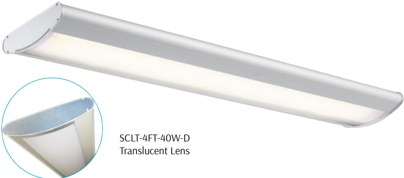
SCLT-4FT-40W-D Translucent Lens