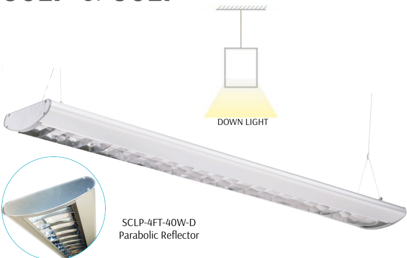
SCLP-4FT-40W-D Parabolic Reflector