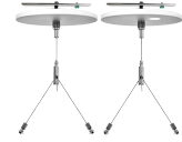
Adjustable 6 Ft. Suspension Kit Select a Y-Connector Key Hole Set (Not Included) See Page B37