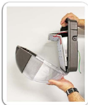
Redesigned housing for LED